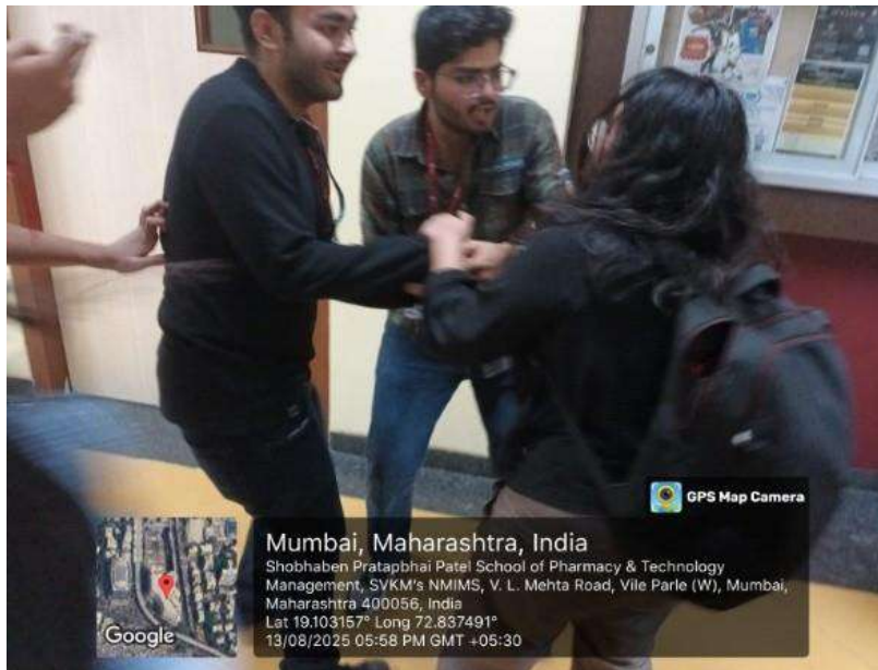
The begging, borrowing and stealing!