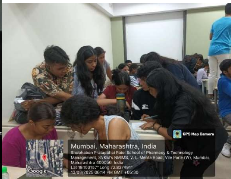
Review of the collected items.