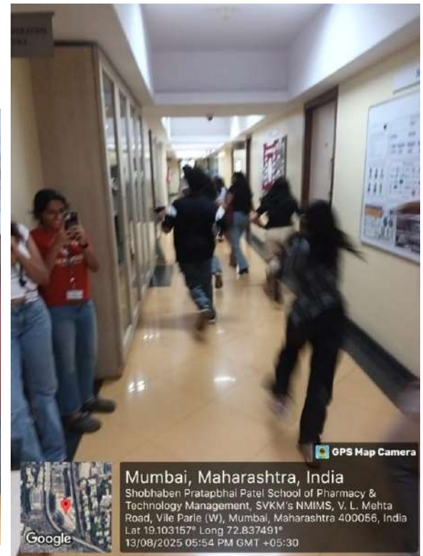
The halls bustling with excitement!