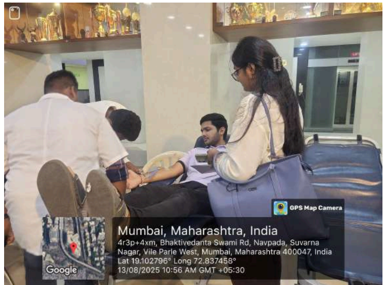
Donor donating blood

Date of Submission of Report: 13 th August 2025