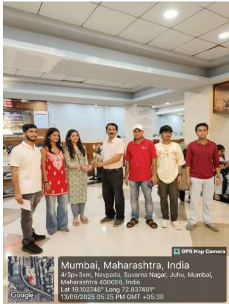
Kshamta EB with IRCS members