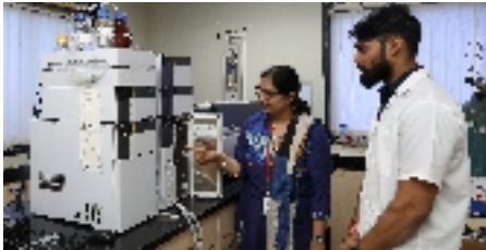
LC-MS/MS (Liquid Chromatography / Mass Spectrometry)