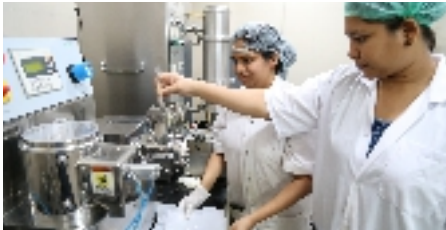
Pilot Plant (A small scale manufacturing Unit)