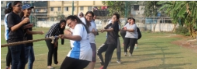
Excaliber Sports Event