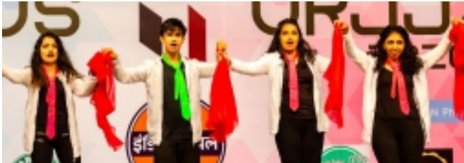
Isthmus (Corporate Event) – Urjja (Cultural Event)