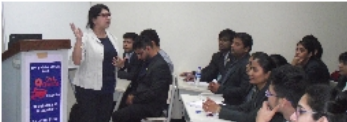
Chai Pe Charcha